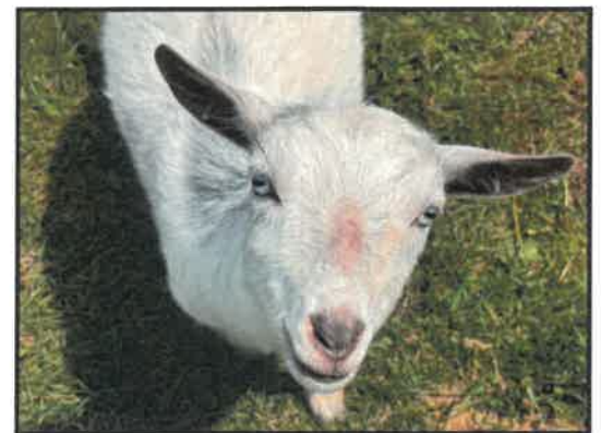
Friendly and Photogenic Goat