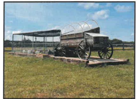
Covered Wagon Chicken Coop